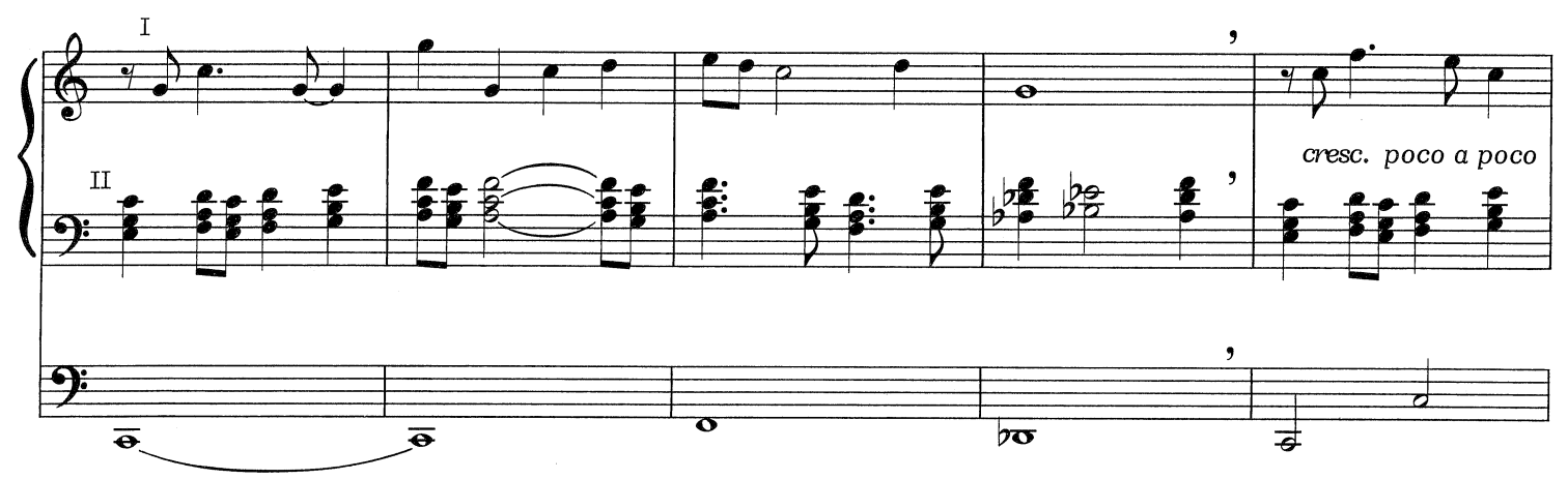
Copyright © MCMLXXXIV Laurel Press. All rights reserved. International copyright secured. Printed in U.S.A.