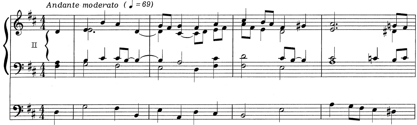
Copyright © MCMLXXXIV Laurel Press. All rights reserved. International copyright secured. Printed in U.S.A.